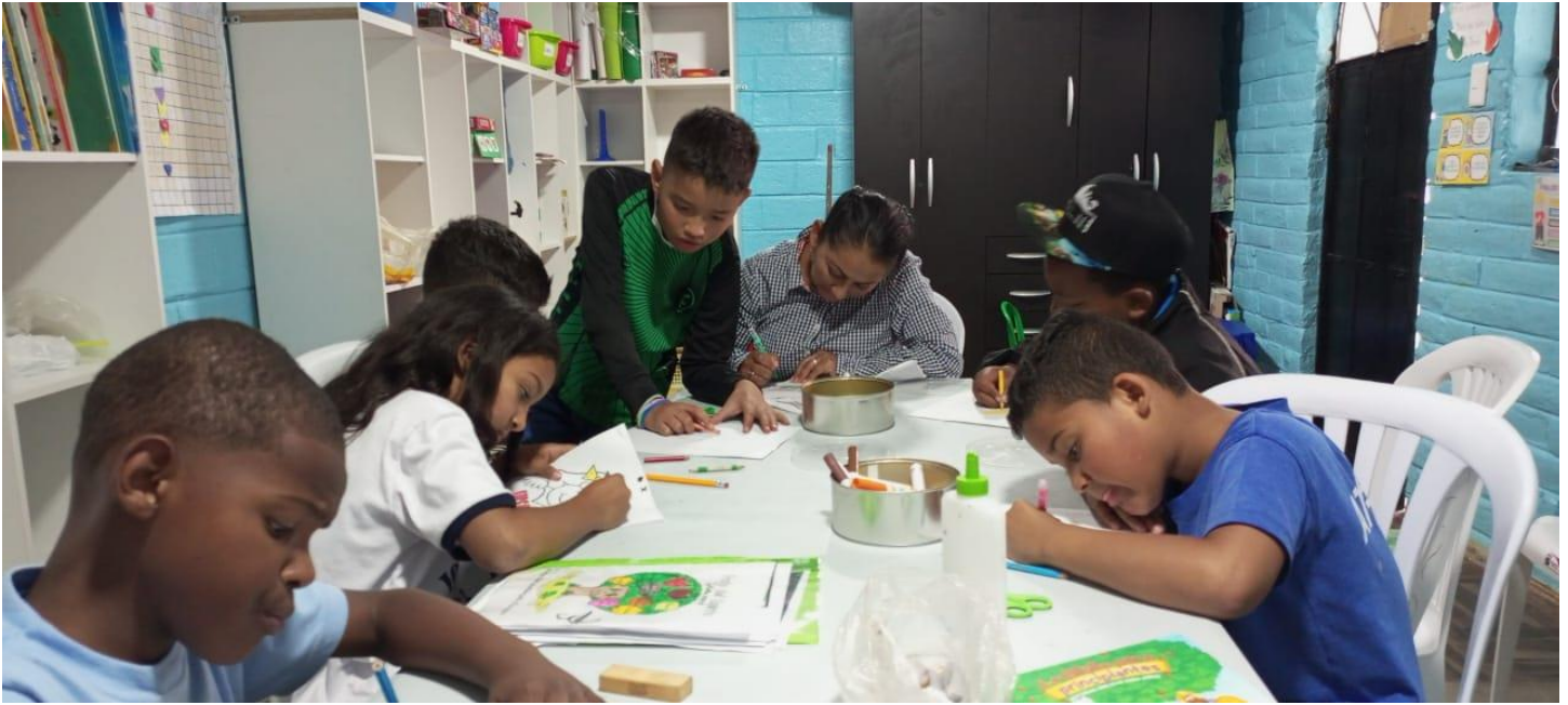
One of the Bible class sessions in the afternoon. Too cool.

Blessed is the man who perseveres under trial, because when he has stood the test, he will receive the crown of life that God has promised to those who love Him. James 1:12