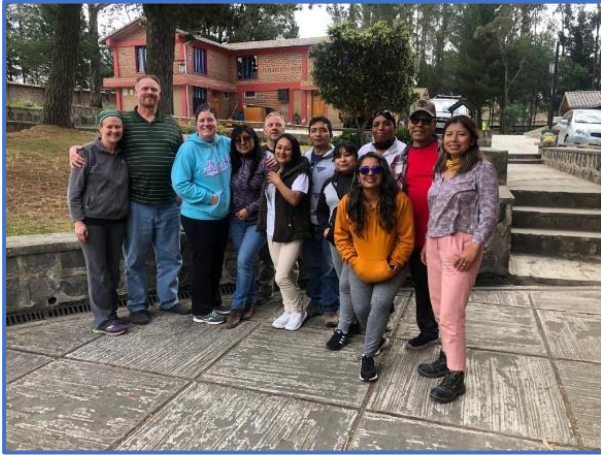
Our wonderful staff and missionaries of the camp at the retreat.