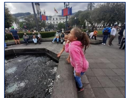
Walking through the historical center.