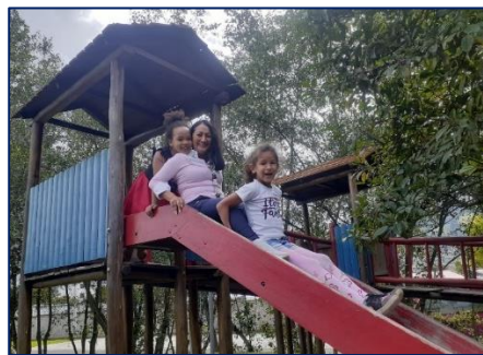
Kids and staff enjoying the park.