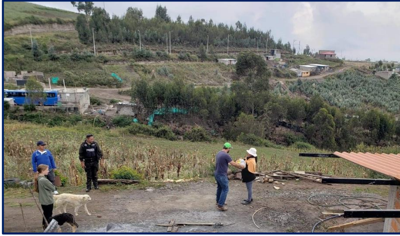
Time up in the mountains with the police delivering food.