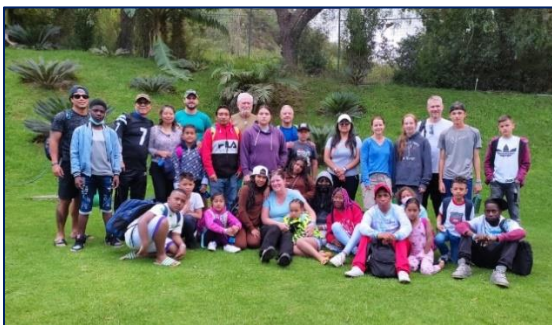
All of us finishing the day at the water park.

The summer break from school has brought a different kind of schedule. The kids are going to the park twice a week and a movie in the center once a week. We also try to do something different once a week. Some of those different things has involved going through the historic part of town learning about Quito and going to an indoor park/ convention center. A friend of ours has been coming and doing different types of crafts with them. The kids are looking forward to going to a restaurant as we have been working on teaching table etiquette. The highlight of the summer was definitely the water park. Wallhighway Baptist Church spent nine days with us and one of the outings we did together is an adventure to a water park about a hour and 20 minutes from the center. We only took the kids ages seven and older and that gave us a 1:1 ratio of adults to kids. Only a couple of kids could somewhat swim. For several of the kids, they had never put their heads underwater. It was a super fun and exciting time with them.