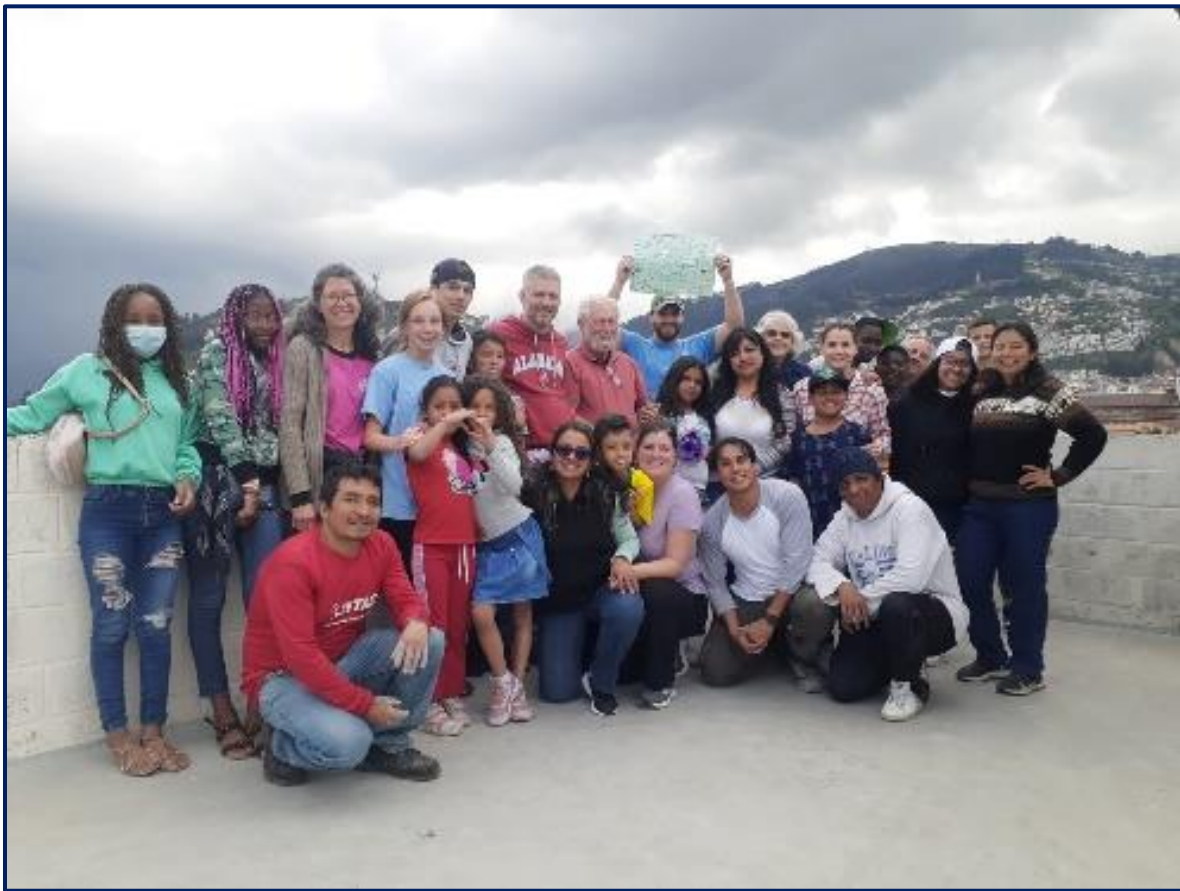
Our see you later and thank you. Till next time Wallhighway.

The scripture that comes to mind as I write these things is: